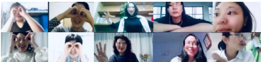
Figure 3. Moment of Participants Playing Games in the Digital Space

The game, “action name”, requires the group members to get to know each other through action. It comes from Boal’s series of games about expressing oneself through the body (Boal, 2005). With this game, individuals get to know each other with their bodies as the form of communication. Unlike in physical space, where the participants can see each other by standing in a circle, the adjusted game online was with a specific form: one participant says a name while explaining the name with action, and then other participants repeat the name and imitate the action. Figure 3 shows the moment of participants playing games in the digital space.