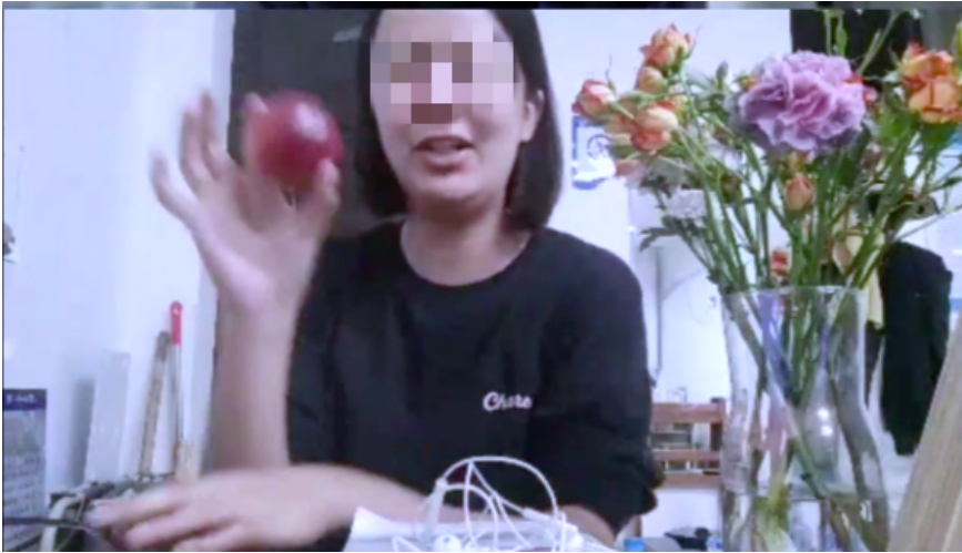
Figure 2. One Participant Describes the Object

Participant G held a peach and described: 'it is a red round peach, really red, and it smells good. I guess it must be tasty. It is not a big peach, but the shape is perfect, and the skin is very smooth. I bought it online. The little peach spent three days travelling here, which means it has visited various places before arriving at my place'. Figure 2 demonstrates the moment of the participant describing the peach.