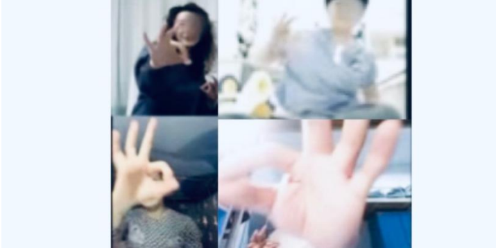
Figure 5. Different Shots Under the Camera Lens

medium shot under the camera lens tends to attract the attention of spectators. Figure 5 shows the different scenes, from close-up to full shot. Individuals are able to choose which part of their body they would like to show, which is different from the physical space where the viewers choose to watch where and which.