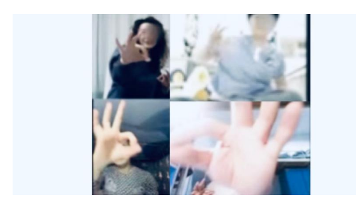
Figure 5. Different Shots Under the Camera Lens

medium shot under the camera lens tends to attract the attention of spectators. Figure 5 shows the different scenes, from close-up to full shot. Individuals are able to choose which part of their body they would like to show, which is different from the physical space where the viewers choose to watch where and which.