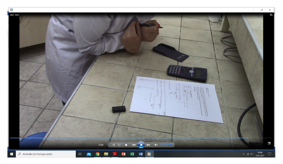
Figure 3. Examples of Student Demonstrations

to find the volume spent from the burette (S2). 46.6 will be subtracted from 50 lastly (S3). The volume of NaOH spent is 50-46.6 (S4). I start by calculating the volume of NaOH spent. Since the burette is 50ml, I find it as 50-46.6 (S6). The volume spent for the first part is 50 ml and the volume of HNO<sub>3</sub> is 46.6 ml. Then the student reads the question again and realizes that he/she has written the volumes incorrectly. Then he/she cannot decide whether the volume will be 46.6 or 50-46.6 (S7).