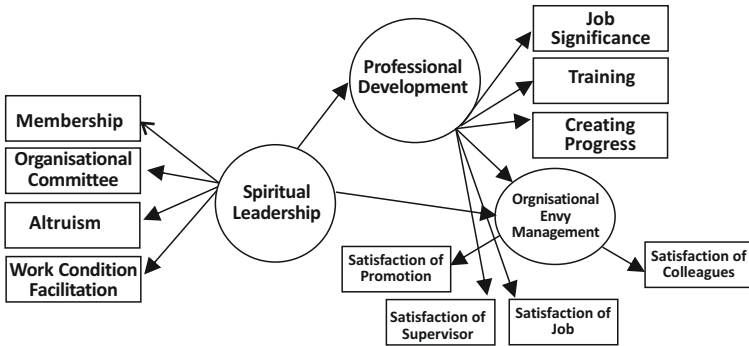
Figure 1. The Conceptual Model of the Study.